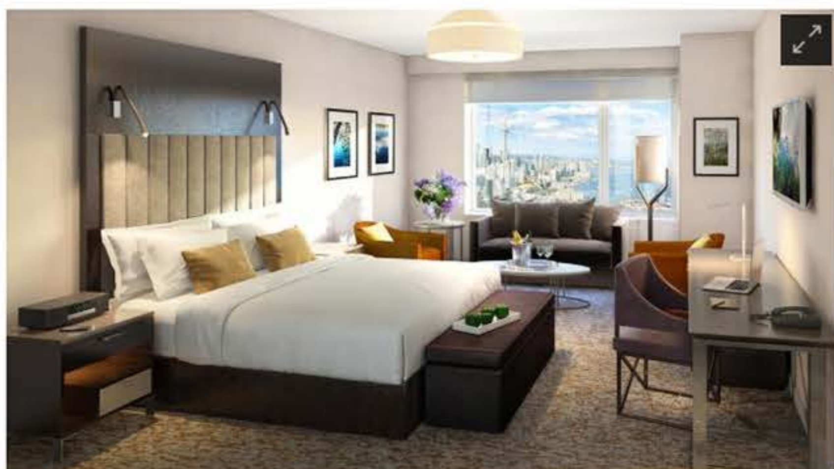
A rendering of a room in the Hotel X Toronto.

HOTEL X TORONTO: This property, due to open in the northern autumn, is in the Exhibition Place district, best known for the annual Canadian National Exhibition (August 18 to September 4 this year) and conventions. It's a few kilometres from downtown, but quite close to the edgy restaurant, bar and shopping scene of the West Queen West neighbourhood. They're calling Hotel X an urban resort, with rooftop pool and bar and a grassy area that should suit sunworshippers; views of Lake Ontario and downtown Toronto will be spectacular. Dining options include one on the ground floor with plenty of natural light and another on the roof. Hotel X is part of The Library Collection, which operates branded boutique properties in New York plus Aria Hotels in Budapest and Prague. There's a massive sports complex planned next door, with swimming pools, tennis courts and other facilities. The hotel will feature cinema space, perfect for the annual Toronto International Film Festival, held every September. From $C350.