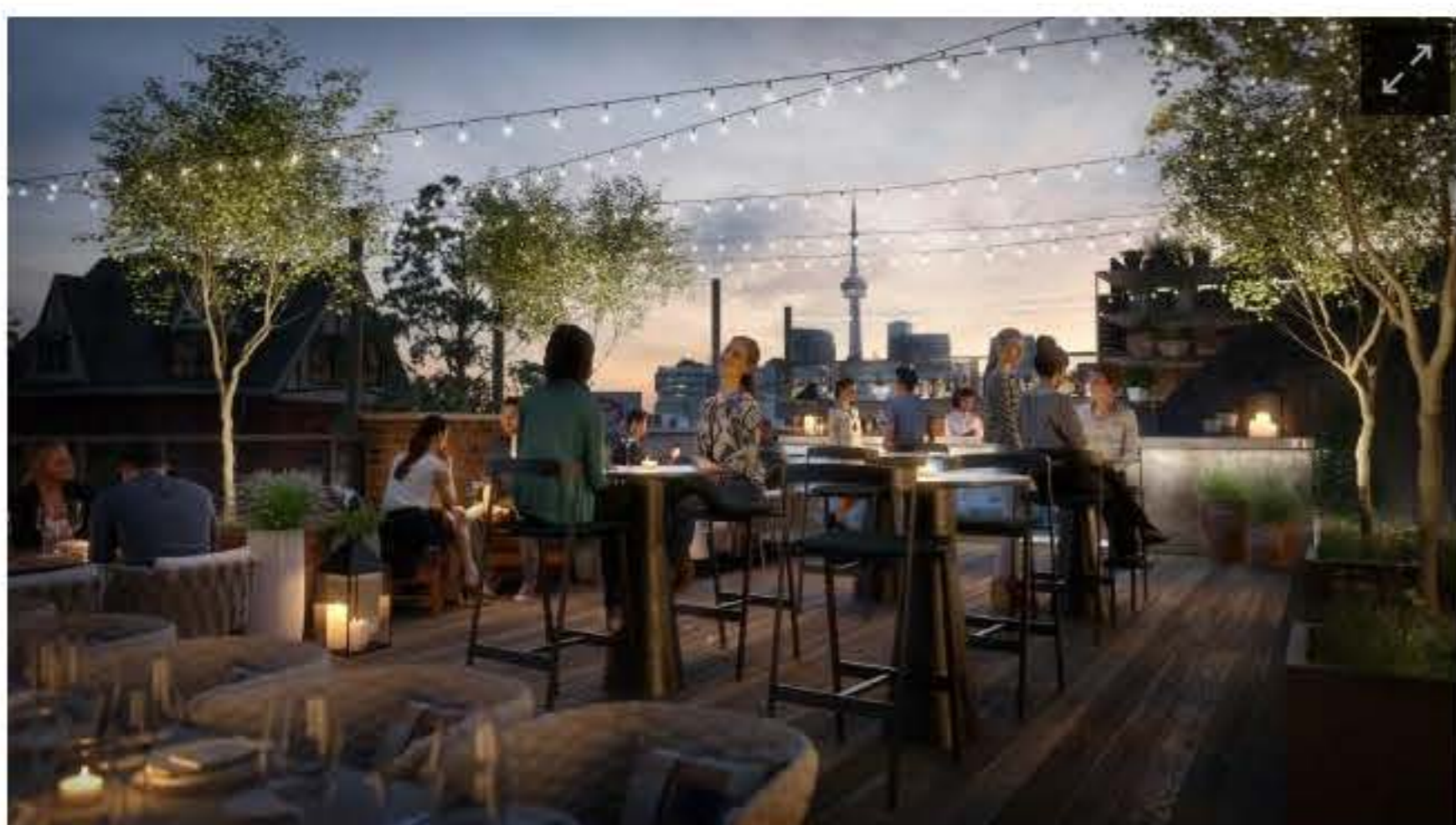
An artist's impression of The Broadview Hotel's rooftop terrace.

THE BROADVIEW HOTEL: Located in Toronto's trendy Riverdale district, The Broadview Hotel has just opened in a beautifully restored 125-year-old building that once housed a notorious strip club called Jilly's; some racy-looking wallpaper and other touches recall its past. The hotel features 58 guestrooms and five venue spaces that can be used for the likes of wedding receptions, seminars or corporate events. The second-floor Lincoln Hall has space for up to 240 guests for cocktail receptions, while the smaller Lincoln Terrace is an outdoor spot with fabulous views to downtown, just across the Don River and reached by the popular Queen Street streetcar. The 7th-floor rooftop bar has unobstructed views of downtown, along with a glass pyramid-shaped skylight. Expect a cool, millennial-friendly design and a colourful lobby. All guestrooms feature a record player for on-trend vinyl, minibars stocked with local produce and top-quality kingsize beds. From $C309.